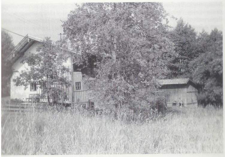
The mill, her home in Breitbrunn

her relatives in Breitbrunn am Chiemsee and lived there in the old mill house until almost the end of her life.