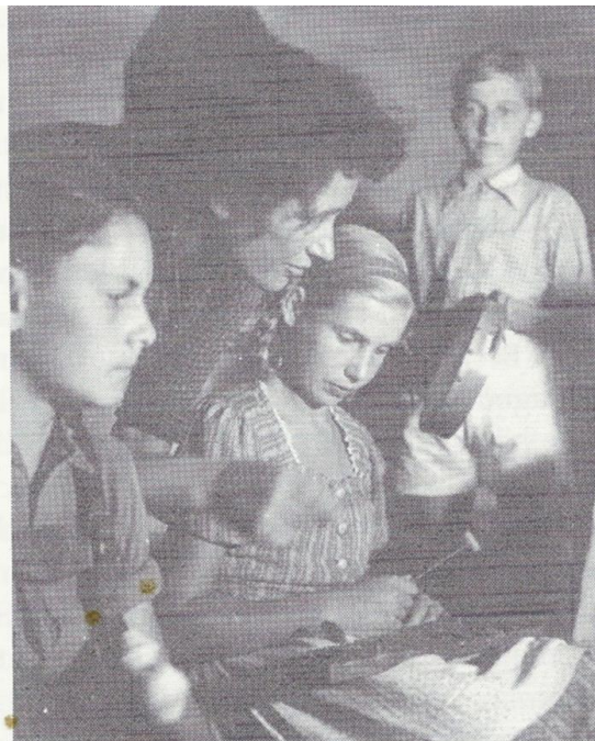
Teaching at the Primary School in Breitbrunn

Soon after her arrival she was obliged to work in a military hospital with wounded people in curative gymnastics.