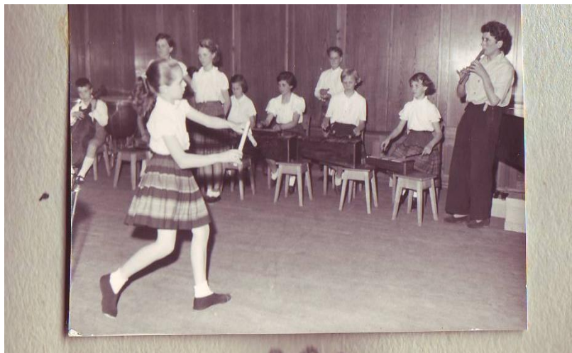
Children's class at the Mozarteum