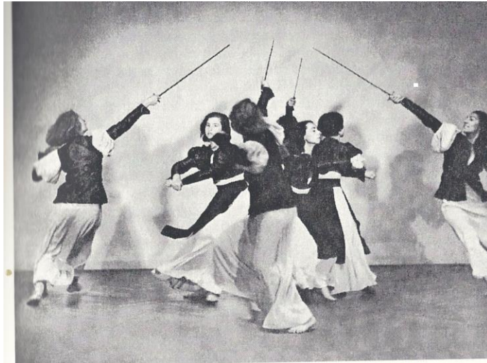
The dance group of the Günther-Schule, Photo: Enkelmann Carl Orff-Stiftung, Archiv Orff-Zentrum München

Some of Keetman's compositions for the dance group (selection from about 70 dances)